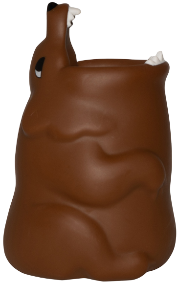
product size: 5.5" x 3"