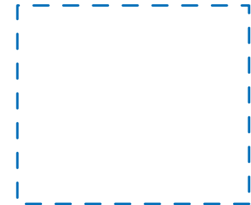
BACK - FULL COLOR

Full color printing available imprint size: 1.75" x 1.5"