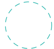
Full color printing available imprint size: 1" x 1"