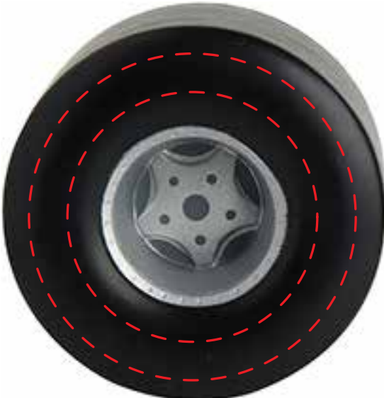
2.75" x 1.5"

COMPANY NAME: PO #000000 IMPRINT COLOR: QTY: