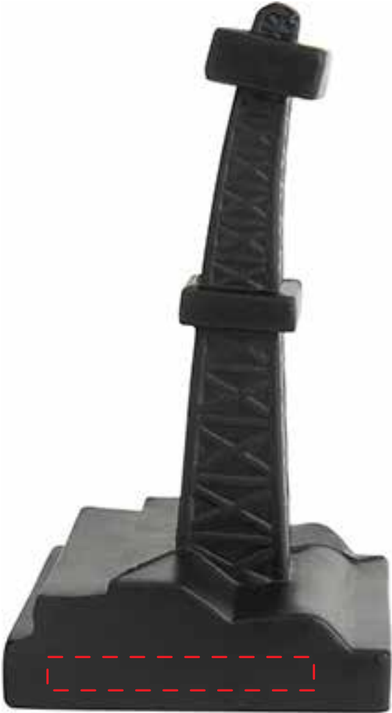
2.75" x 5"

COMPANY NAME: PO #000000 IMPRINT COLOR: QTY: