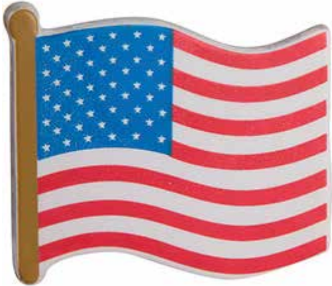
3.5" X 3"

COMPANY NAME: PO #000000 IMPRINT COLOR: QTY: