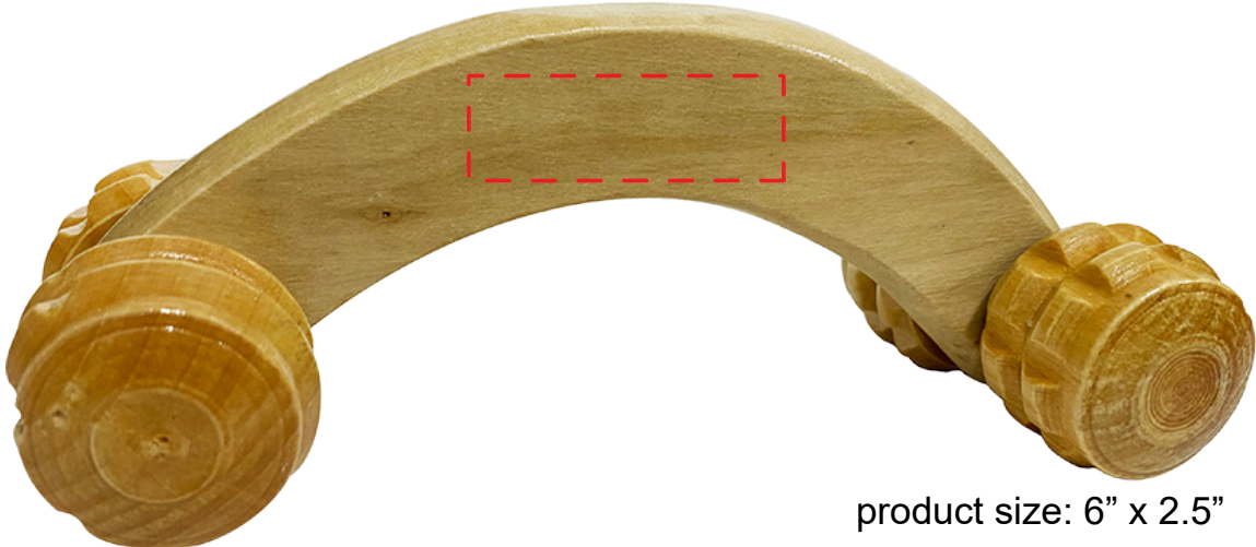
product size: 6" x 2.5"