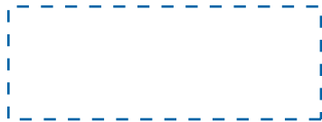
FULL COLOR DIGITAL PRINTING IMPRINT SIZE: 1.8" x .65"